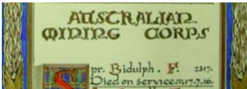
Roll of Honour Book of Tunnellers, St. Paul's Cathedral, London