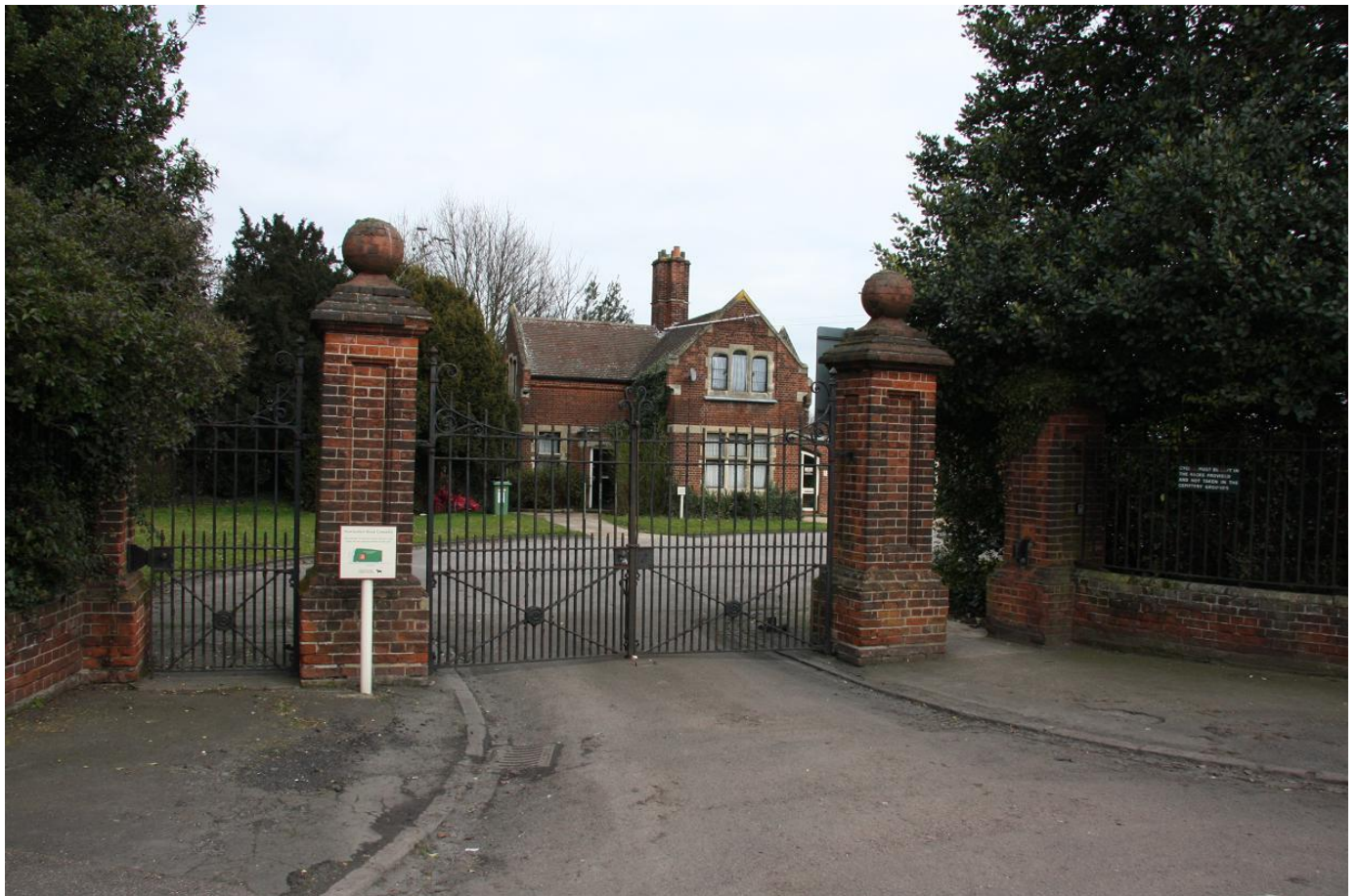
Entrance to Cambridge City Cemetery & Map (below)